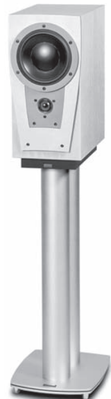
Same instructions apply for Contour S 1.4

Dynaudio International GmbH , Ohepark 2, 21224 Rosengarten, Germany, Phone +49 - 4108 - 4180 - 0