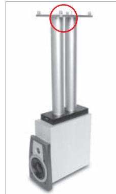
See step 7 to 9