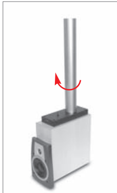
See step 4