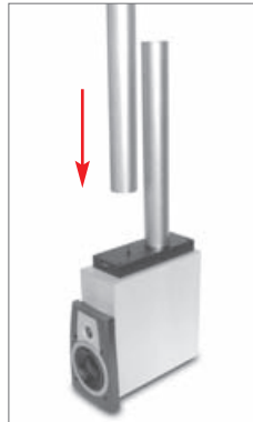
See step 5